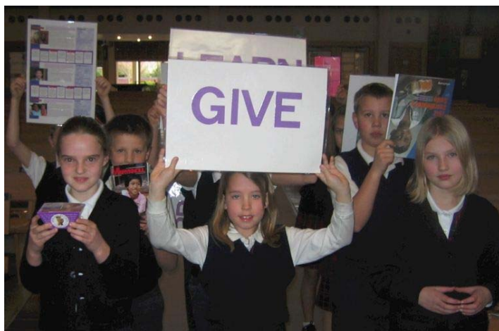
Contest winners from Holy Rosary School, in Edmonds, WA

Please invite young people that you know to experience the joy of mission through our art and essay contests! You can learn more about current contests here .