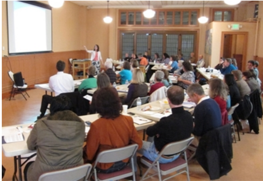
Attendees listen to a presentation on the "Four Levels of Happiness" at a recent Life Principles Academy at Blessed Sacrament Church in Seattle.

"Thank you Healing the Culture for giving a presentation that is absolutely top drawer. I suspect there is in no other in the world like it. It is unmatched in its approach, its power and its ability to convey simply, concepts from some of the finest thinkers of the human race throughout history."