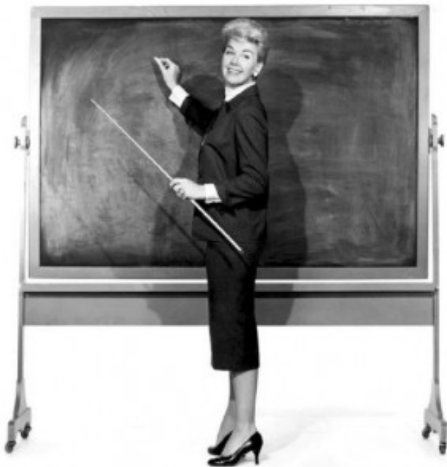
Washington Post, 2013