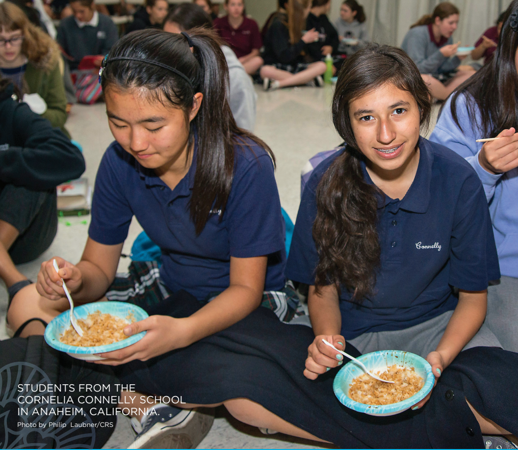
STUDENTS FROM THE CORNELIA CONNELLY SCHOOL IN ANAHEIM, CALIFORNIA.