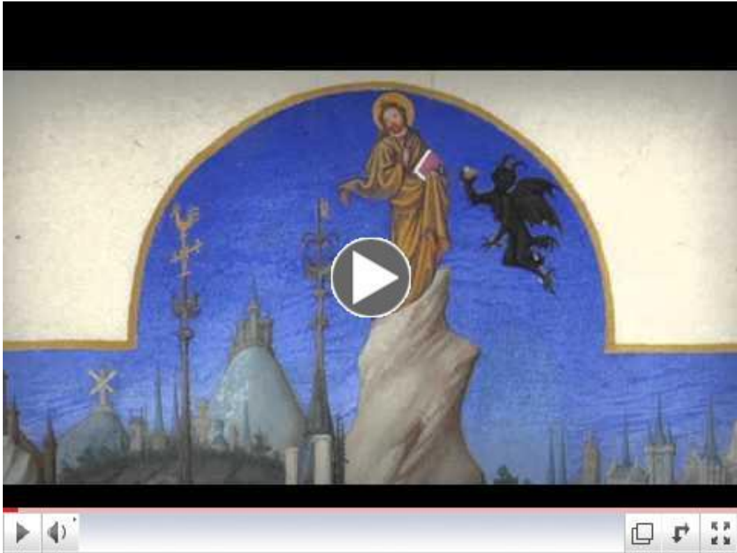
Arts & Faith: First Sunday of Lent