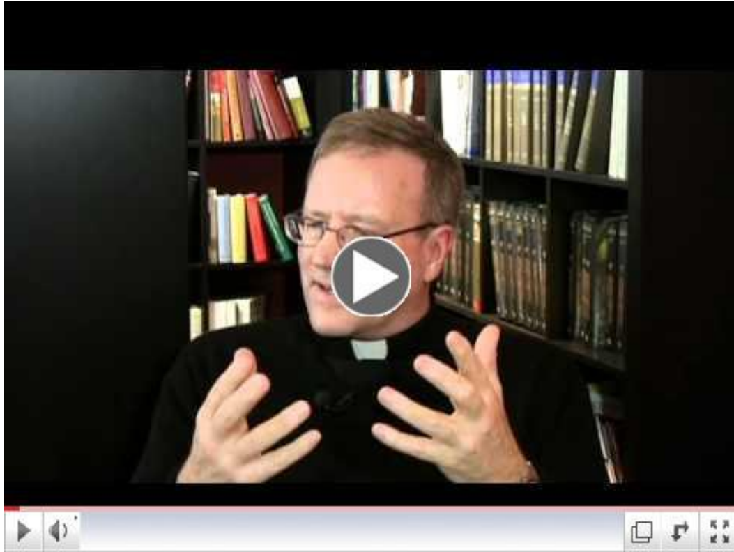
What Are the Practices of Lent?