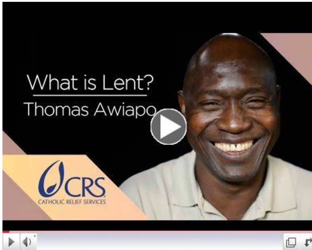
What is Lent?